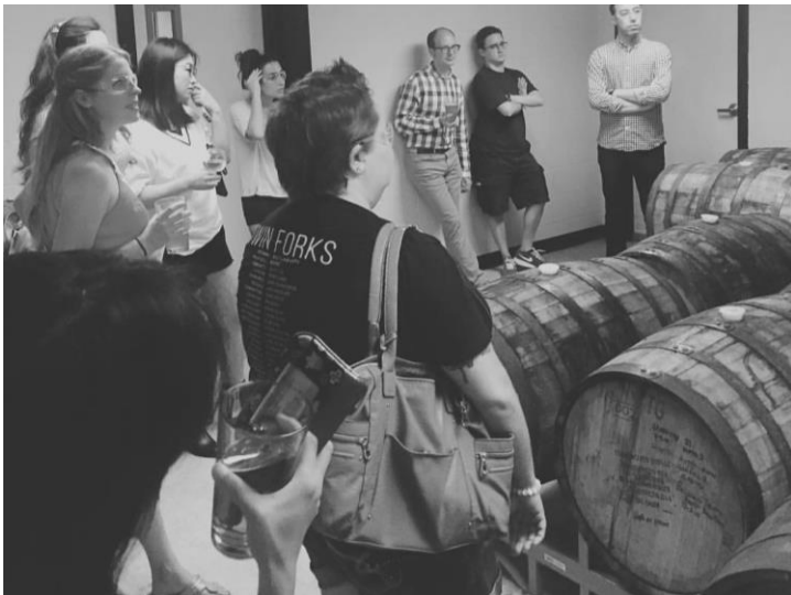
GLS members receive a free behind-the-scenes tour at First Magnitude Brewery, July 2016